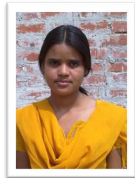
(The five Swabhiman girls supported by F4F and the School Fund)