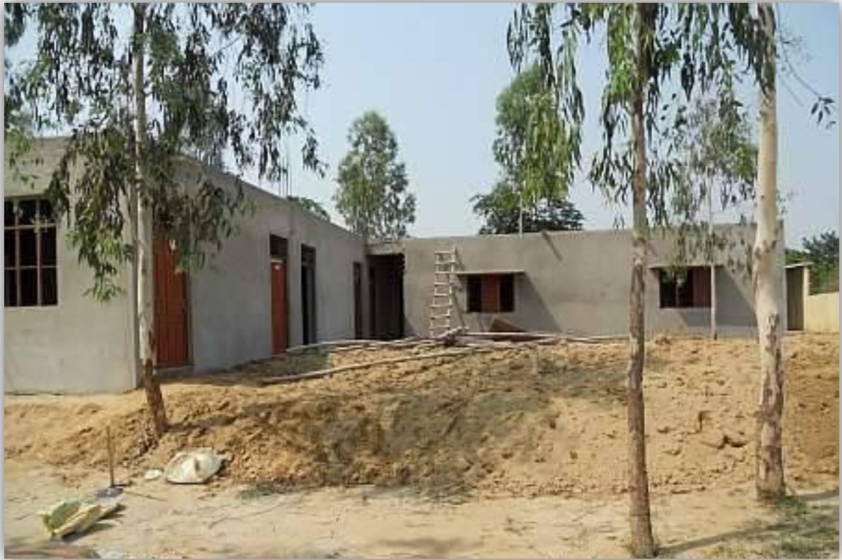
(Toilets and Storeroom)