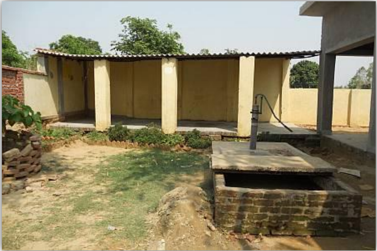
(Boundary Wall and Gate)